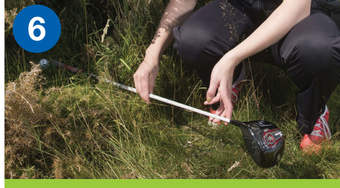
Longest club, putter aside, to be used for measuring

The club to be used for measuring purposes nall relief situations is the longest club in your pag, other than your putter.