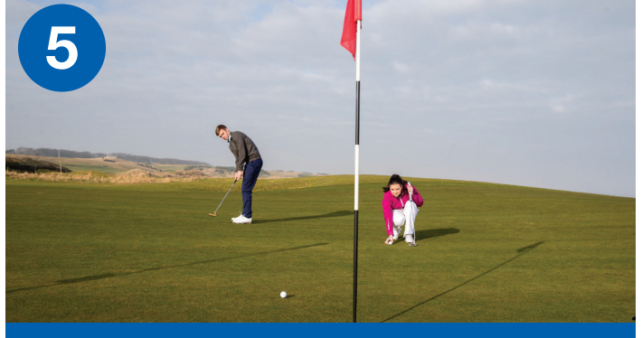
Flagstick can remain in when putting You will be allowed to hit the unattended flagstick in the hole when putting.